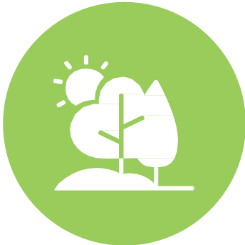
ENVIRONMENTAL & CONSERVATION